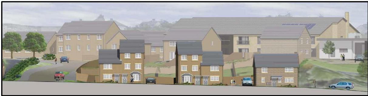
Ashbrow: Street Scene

A preferred bidder was confirmed following procurement through the Homes England DPP2 framework, they secured planning permission for their scheme proposal in June 2018. As they have progressed with the detailed design of their scheme, they have identified a number of problems, in particular relating to highways and drainage issues, which have impacted on their ability to deliver the scheme. In order to address the issues which have arisen, some amendments were required to the scheme originally proposed. These changes were approved by Cabinet on 18 th June 2019 and are the subject of a new planning application which has recently been approved. A start on site is anticipated early 2020.