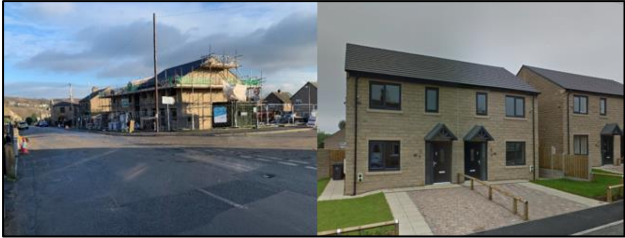
Leymoor Road, Golcar: Pre and post-completion