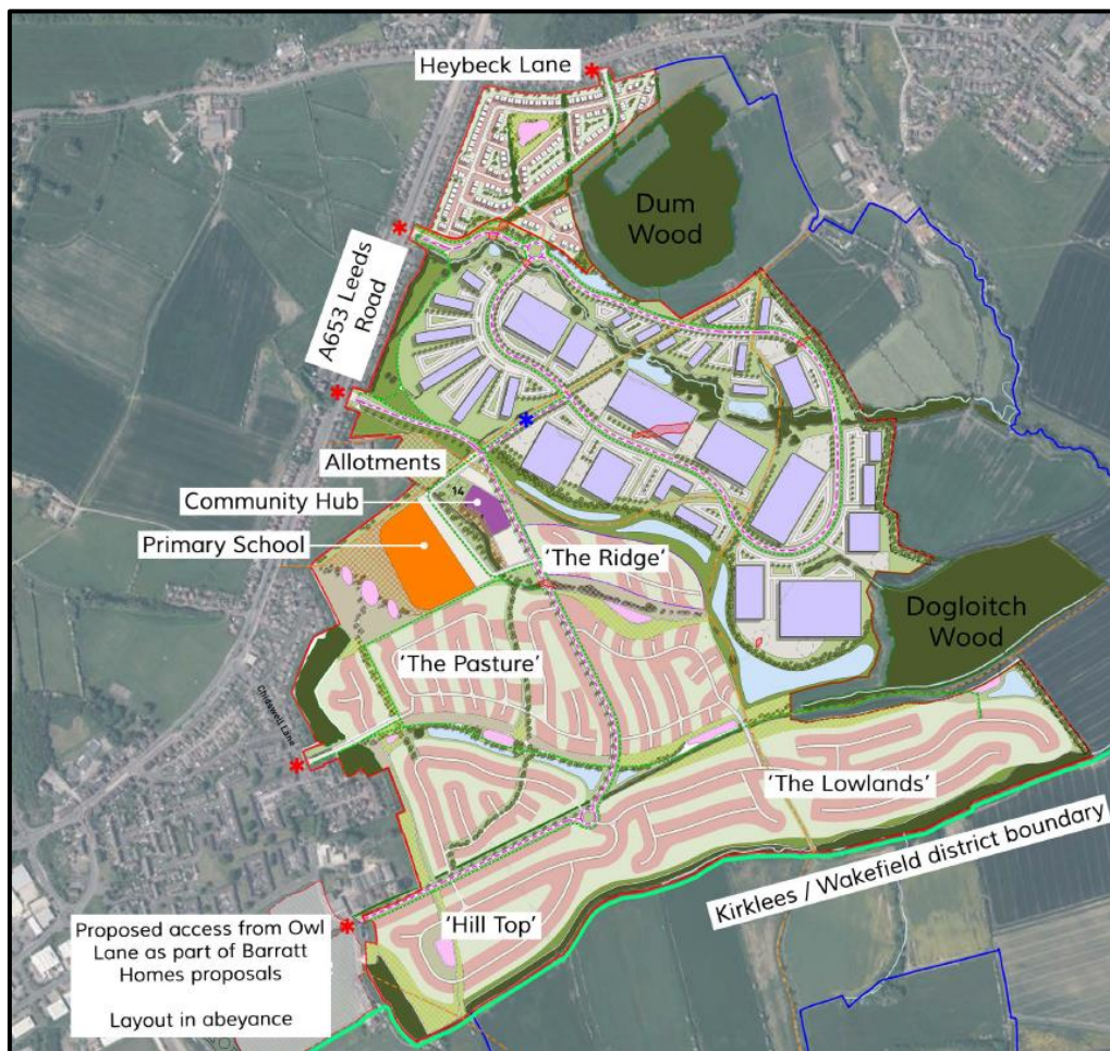
Chidswell: Site Plan

The pre-application 2018/20078 was taken to Strategic Planning Committee in July 2019, following which the masterplan and associated documents have further developed. It is currently anticipated that two outline applications (one for the 'Heybeck Lane' first phase and another for the wider site) will be submitted in February 2020.