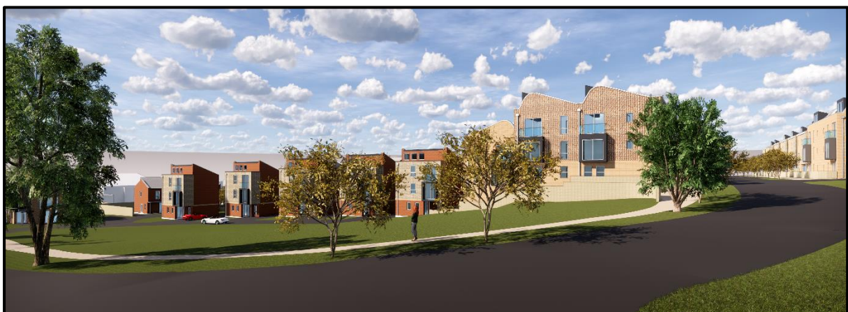
Bradley Park: 3D Street Scene View

The designs for the Tithe House Way site have taken cognisance of the illustrative masterplan for the wider site approved by Cabinet and the detailed approach to this site will be taken forward, taking account of the Tithe House Way site's significance within the wider allocation.