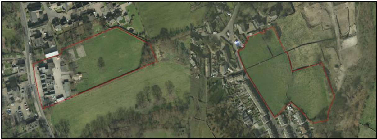
Former Gomersal Primary School, Gomersal