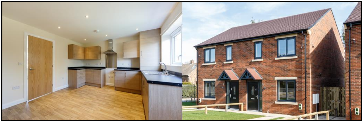
Sycamore Avenue, Golcar: Interior and completed build

Fernside: This scheme of 10 lifetime bungalows, including two fully adapted units, establishes a pilot demonstrating the benefits of modular construction. The Structured Insulated Panels (SIPs) system was preferred due to the possibility of creating flexible layouts when compared to a Pod system. The offsite construction of the units is delivered using an innovative social value model established by a social enterprise.