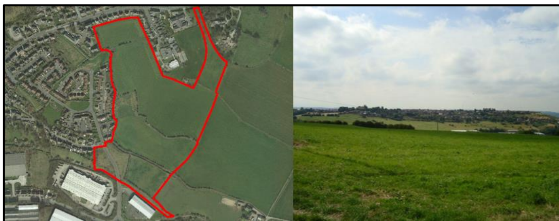
Soothill: Aerial view and site view

3.1 Soothill – this site is located approximately two miles from Dewsbury Town Centre, a mile from Batley Town Centre and is close to an established residential area. Homes England funding is available for investment to deal with abnormal development constraints and it is a requirement of the funding that these works are completed and the grant claimed by the end of March 2021. It is anticipated that the majority of these works will be undertaken by the Council's appointed development partner. The procurement of a partner is underway through Homes England's DPP3 framework. Formal invitations to tender were issued in August 2019 and the Council aims to appoint a preferred developer in early 2020.