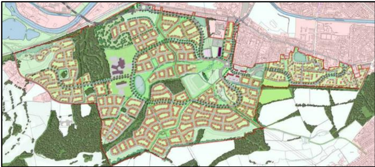
Dewsbury Riverside: Site Plan

On 19 th March 2019 the Council’s Cabinet endorsed the Masterplan and Masterplan Framework for the development of the Kirklees Local Plan housing allocation ( HS61 ) at Dewsbury Riverside and authorised the Council to enter into an agreement with the Combined Authority to accept a Local Growth Fund grant to facilitate infrastructure delivery at Dewsbury Riverside.