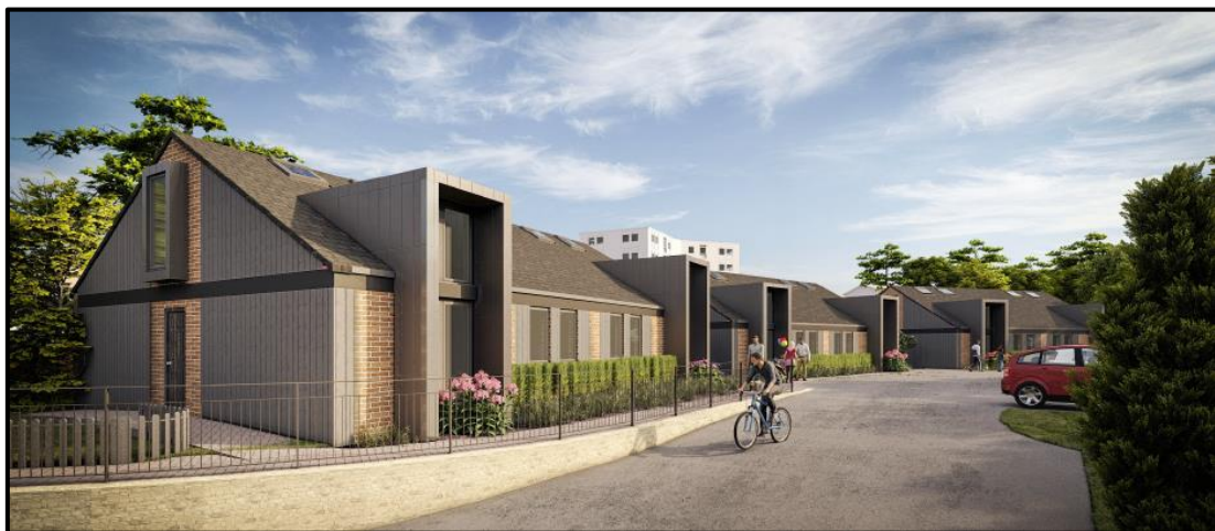
Fernside Lifetime Bungalows: Artist's Impression

Fernside: This scheme of 10 lifetime bungalows, including two fully adapted units, establishes a pilot demonstrating the benefits of modular construction. The Structured Insulated Panels (SIPs) system was preferred due to the possibility of creating flexible layouts when compared to a Pod system. The offsite construction of the units is delivered using an innovative social value model established by a social enterprise.