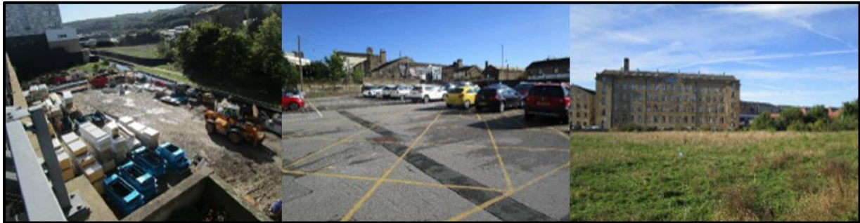
Waterfront site, including Folly Hall Mill

3.2 Waterfront – The site is part of the Waterfront Quarter, directly to the south of Huddersfield Town Centre and adjacent to Kirklees College. The site benefits from health and employment uses in the attractive Folly Hall Mill, as well as the adjoining Huddersfield Narrow Canal, with an integrated walking and cycling network along the tow path. The procurement of a partner through the DPP3 framework was actively pursued in 2019 however due to significant challenges on the site it has not been possible to secure interest in the site through this route. Options for the site are currently being explored.