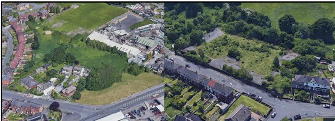
Common Road, Batley

The sites are based across Kirklees, including land off Blue Bell Hill, Newsome, Kitson Hill Crescent and Fox Royd Lane in Mirfield, the former Stile Common school site, Newsome, Sixth Avenue, Liversedge, Woods Avenue, Marsden, Nabcroft Lane, Crosland Moor, and Common Road, Batley.