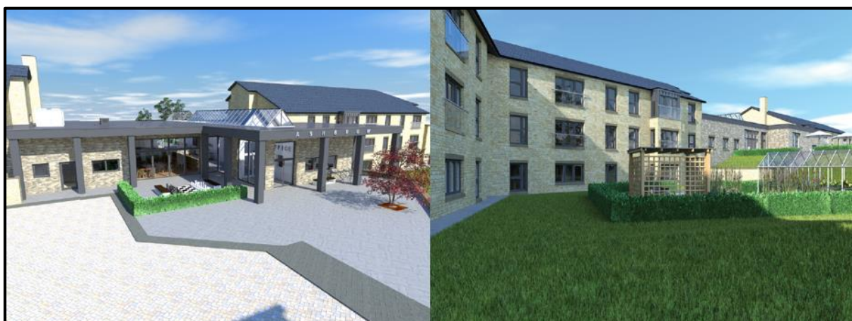
Ashbrow Extra Care Units: Artist’s Impression

Evidence from Registered Providers confirms that extra care schemes should be fully integrated into wider developments so that they effectively deliver well-being outcomes. Parcelling off a segment of a site for extra care is not recommended early in the process as phasing and site areas are not sufficiently developed and defined, which would present a key risk to the wider scheme delivery. The use of a packaged approach would also pose a risk to the delivery and momentum of the next sites where quicker options (such as the Strategic Registered Providers Programme) exist to bring forward housing.