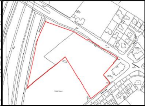
Hartshead Moorside, former school site