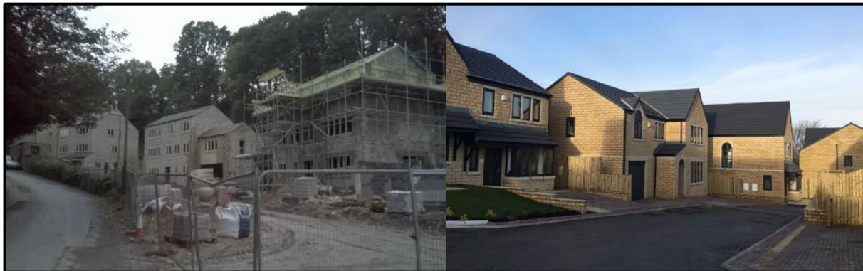
Thirstin Road, Honley

Highlights include Thirstin Road, Honley, which is a challenging site with previous infrastructure and remediation issues. Working with the agent and developer and linking with planning and S38 adoption colleagues, brokerage has assisted the re-planning of the scheme and start on site. The 17 plots are now all under construction, with 5 homes up to roof level as of October 2019. Plots are now being reserved by buyers.