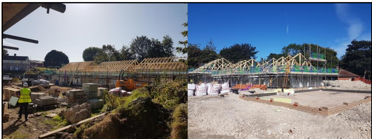
Mayman Lane: on-site progress

The new housing, on the site of the former Woodwell House care home, is being developed and managed by Choice Support/MCCH, a national charity supporting people with autism and learning disabilities. Kirklees Council has worked in partnership with Choice Support/MCCH to bring forward the development. The project has attracted £1.784mill Capital funding from NHS England's Transforming Care Partnership (TCP) fund.